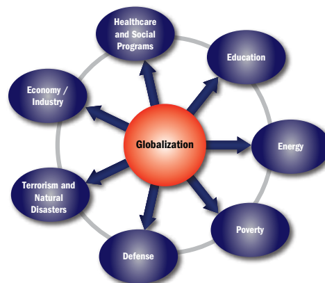
Global Complex Issues Transcend Geographic Borders and Organizational Boundaries

Booz Allen Hamilton, a leading strategy and technology consulting firm, coined the term for this type of larger system—a “Megacommunity.” We define a Megacommunity as a public sphere in which organizations and people deliberately join together around a compelling issue of mutual importance and follow a set of practices and principles that make it easier for them to achieve results.