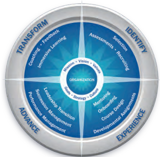
Accelerated Leadership Development Framework

Booz Allen Hamilton, a leading strategy and technology consulting firm, has a proven record of designing and applying leadership development solutions for clients. Our integrated human capital and learning systems professionals expertly tailor comprehensive solutions that equip leaders with the skills to confront the challenges organizations face. Our approach blends industry-leading human capital solutions with deep learning systems expertise to speed up the leadership learning curve. Our multidisciplinary expertise in project development, program design, and thought leadership delivers long-lasting results.